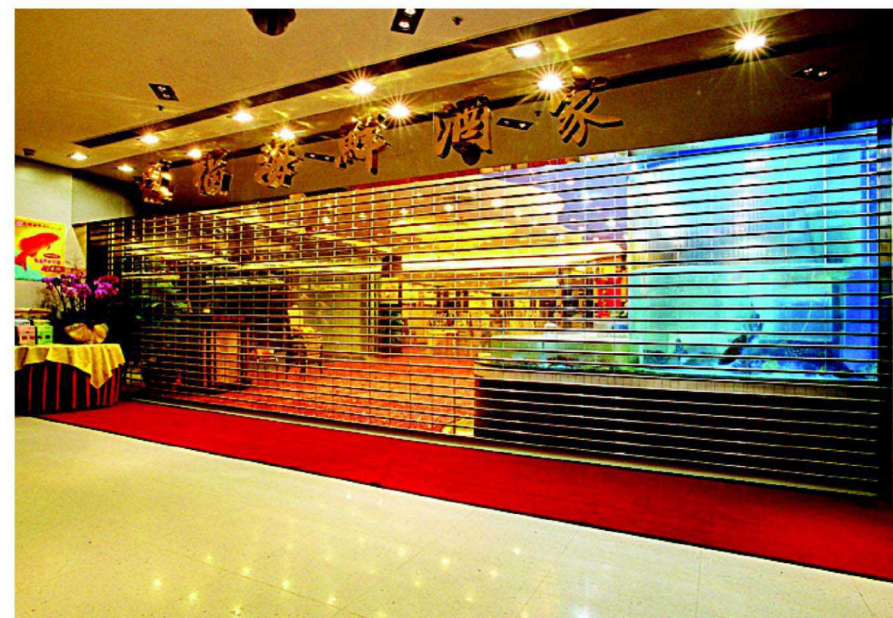
Chinese restaurant with a Clearseal I transparent roller shutter