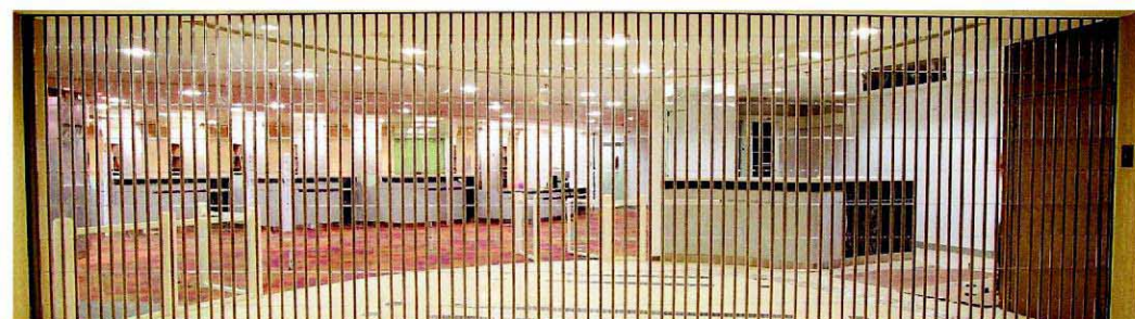
Clearseal I laterally sliding shutter, public library